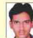
Obeder Rehman Retail Shop