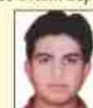
Anam Jain Building Material Shop