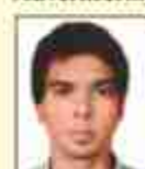
Amit Babel Auto Parts Shop