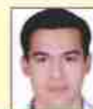
Lalit Meerchandi Perfume Shop