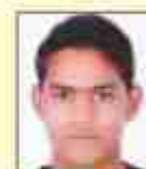
Ravi Mourya Essential Supplies