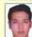
Rahul Rajpal Construction